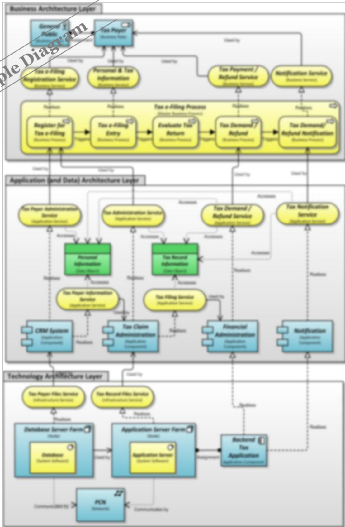
Figure 3: Overview of Target Architecture