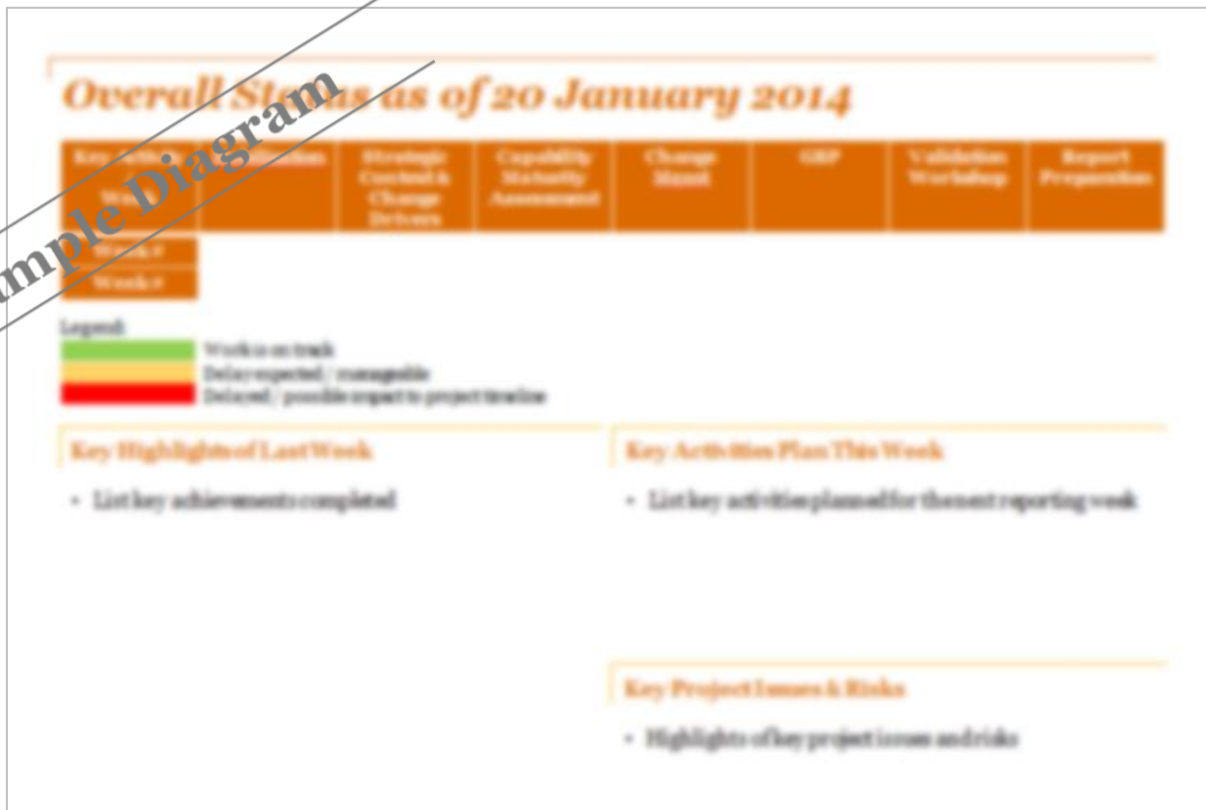
Figure 2: Overview of Project Status