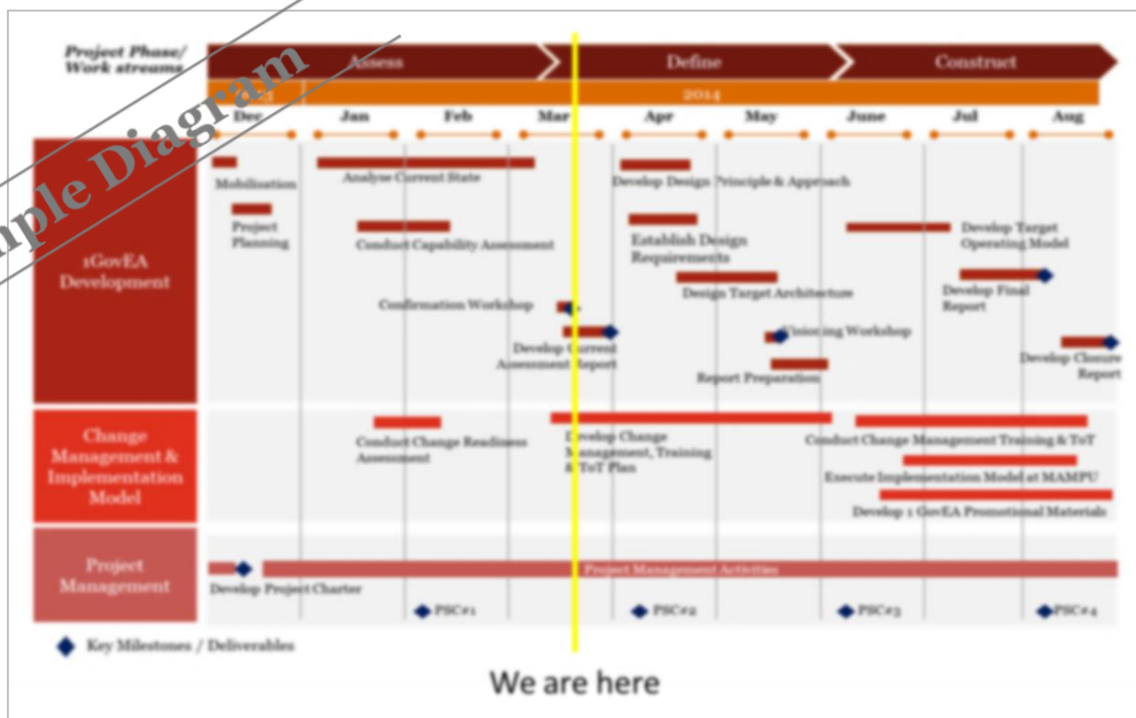
Figure 1: Overview of Project

The project timeline and key milestones achieved since last reporting period, planned activities for next reporting period, unresolved issues, dependencies and project risk should be documented here.